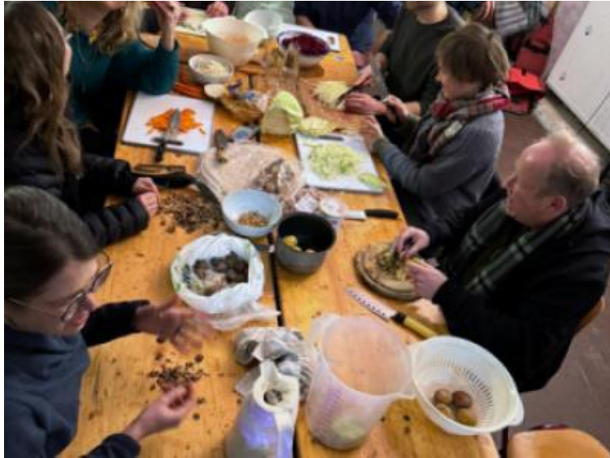
Image: The Polička Collective participating in a cooking session with members from a food policy council, a community-supported agriculture initiative and civil society groups in Leipzig organised as part of their January 2024 writing retreat.

What role can the humanities and social sciences play in making other worlds possible?